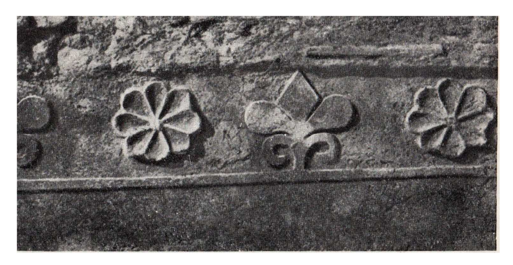
Fig. 1 - The Friso, a Carving in Clay, Teshik kala (after S. P. Tolstov, 1948a).

The pottery based carved decorations are very