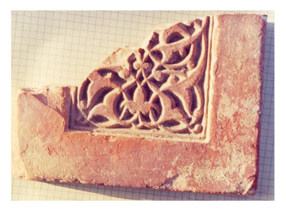
Fig. 6 - Carved Terracotta Tile. (Fired Clay). Mizdakhkan.

dismounted, baked in the kiln, and then mounted back to the same facade. However, such spectacular but labour-demanding veneer technology could not last long. This is why the Khorezmian architects began to use the ornamentally hewn baked bricks. They were convenient to compose different architectural decorations shapes. Later, the glazed architectural tiles appeared (majolica, mosaic). Nevertheless, the cheaper variety of the architectural decoration, the carved clay, was still in use in some regions of Khwarezm.