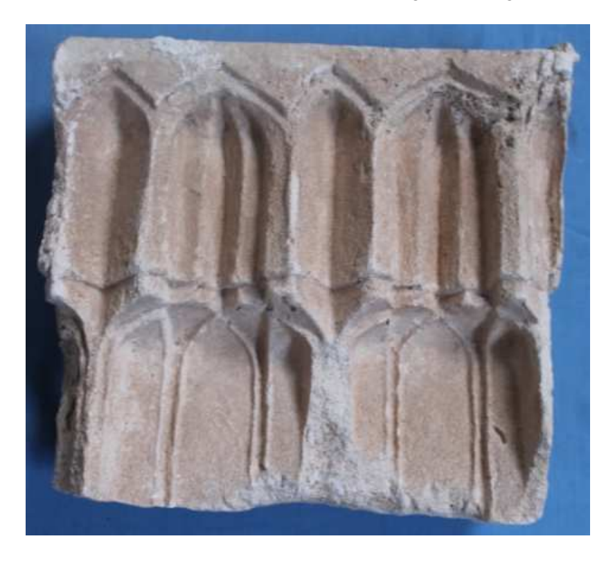
Fig. 5. The Alabaster Details of a Decoration. (Muqarna Stalactites). Mizdakhkan.

Among the findings of carved stucco, special