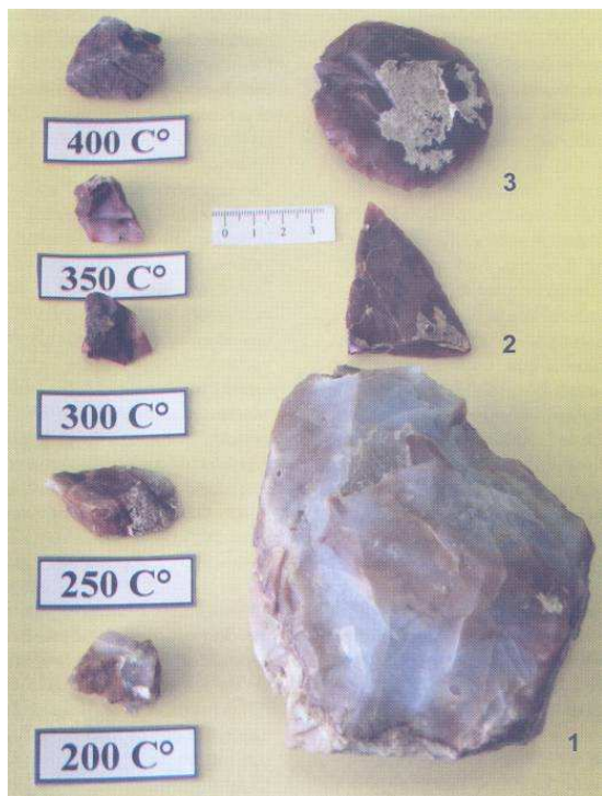
Fig. 5 - Stages of heat treatment on the chert stones and selected artefacts from the Avas-Tűzköves, excavations 2004-2005. 1. Denticulate Mousterian core; 2. distal edge of a Micoquian knife, 3. discoid biface.

This incredibly intensive mining in the Paleolithic period applied special technology. Prehistoric Man first removed the 1 to 1.5 metre thick soil cover and the sand layer overlaying the chert bench, and using “cold technique”, the bench was broken into pieces by large hammer stones. The useless peal layer of the bench was removed, and then, using hammer stones or the so-called fire-heating technique, the part of the bench which bore is best quality was split into pieces of the size of a fist or a double.