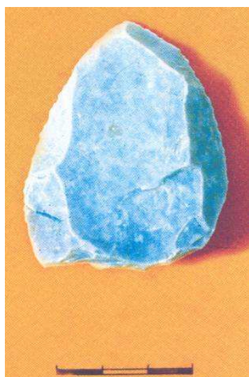
Fig. 4 - Retouched Levallois point from the settlement, near the chert mine, Árpád Ringer's excavation 1988

hand towards the north-east wall of the section, mining activity was such intensive that the chert bench was exploited down to the lower layer with opal content. It seems that for some reason the lower opal part of the bench was left there as some sort of floor. The characteristic pieces of a transitional industry from the Middle Paleolithic to the Upper Paleolithic with Levallois technique, for example a Levallois core for points and typical triangular Levallois points removed from it, were found on the surface of the chert beneath and on the floor. On the 5 to 10 centimetre thick lower cultural layer covering the flint bench, up to the surface, the remains of a different culture, similar to the so-called Denticulate Mousterian were unearthed.