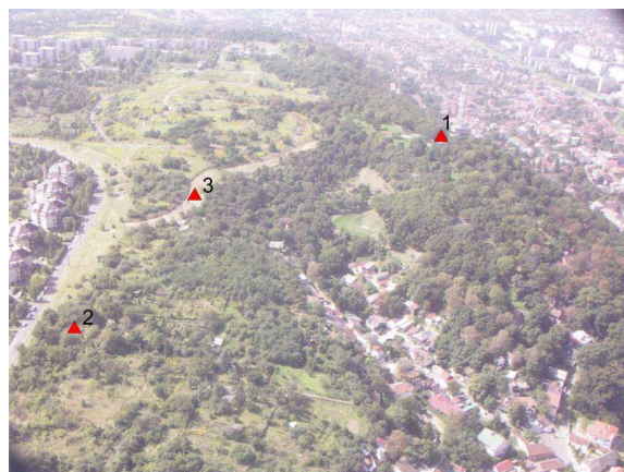
Fig. 3 - Northern part of the Avas Hill at Miskolc and the chert mines mentioned in the text: 1. Avas top 1928-1935; 2. Avas-Tűzköves 1988-1989; 3. Avas-Tűzköves 2004-2005 excavations.

attention in the opinion of Otto Herman, during road construction.